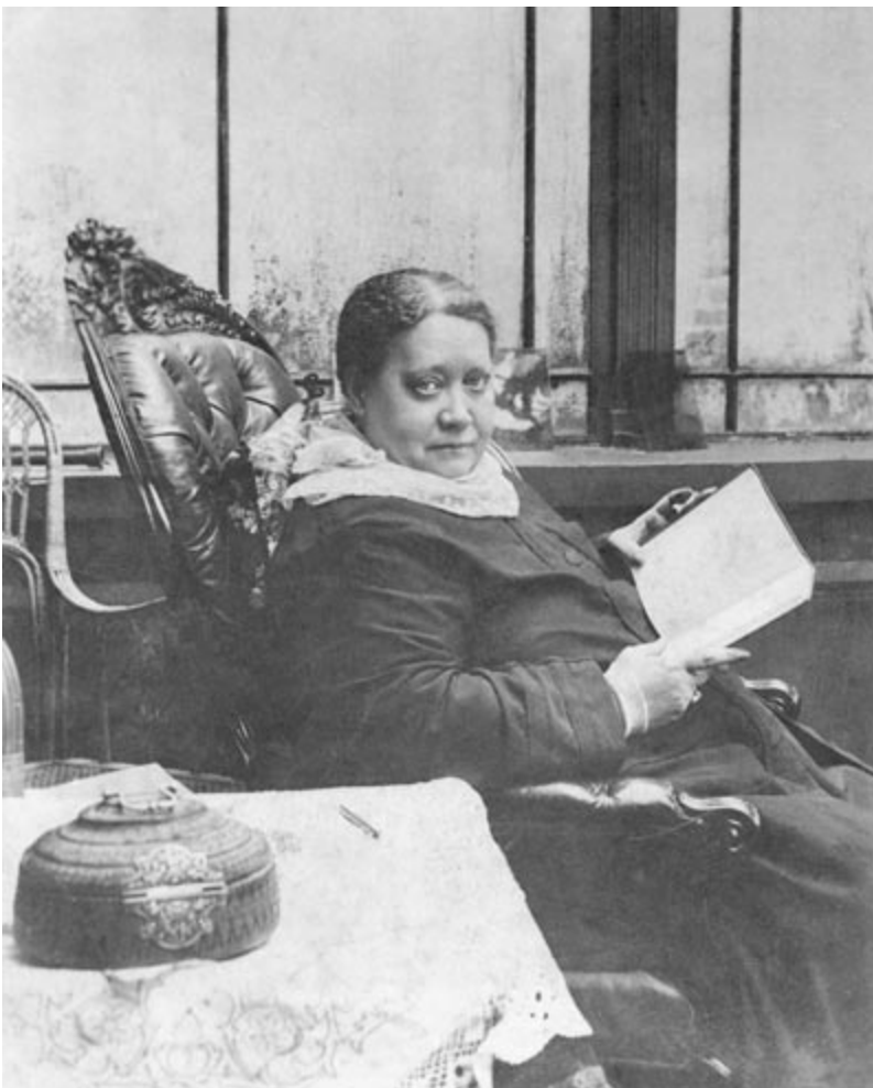
HPB at "Maycot," Upper Norwood, London, 1887